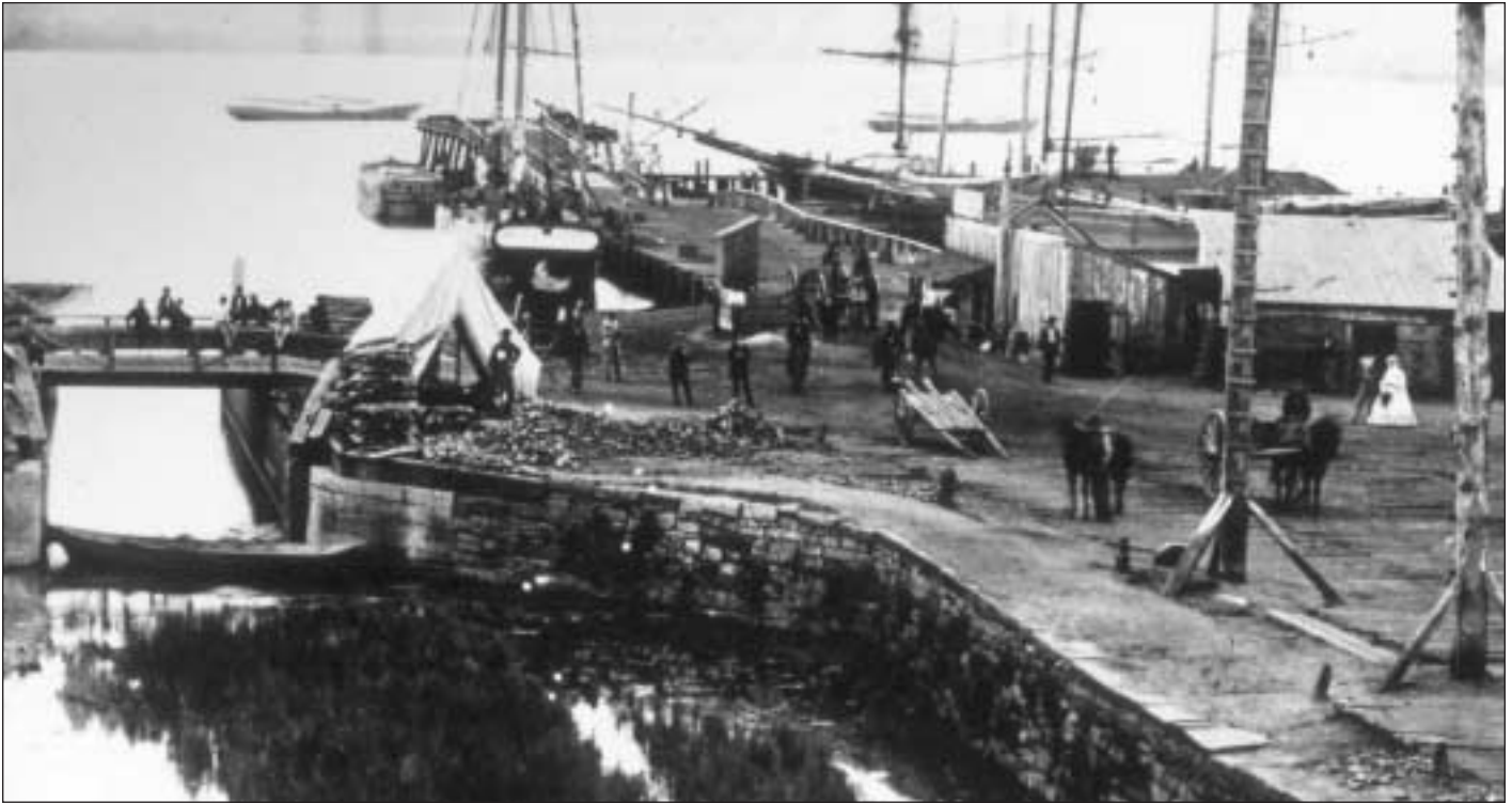
The tidal lock of the Alexandria Canal, which lowered barges into the Potomac, is captured in this early photograph. The canal, with its four locks and basins, was completed in 1845. This waterway connected the Chesapeake and Ohio Canal at Georgetown with the port of Alexandria via an aqueduct bridge. The tidal lock was excavated by Alexandria Archaeology in 1979.

of involving a broader base of private support. OHA continued to assist, contributing especially to the production of the catalogue. Under HAF’s sponsorship, the Antiques Show has developed into a viable, annual fund-raising event. This community activity has raised awareness of HAF and provided funding for a wide variety of preservation efforts, including ownership, restoration and endowment of the Alexandria Academy.