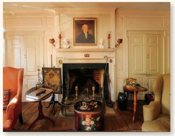
Paneled west wall of the front parlor.

the next 184 years. The family made very few changes to the structure during their ownership. In 1936, the structure was recorded for it historic and architectural significance by the Historic American Buildings Survey (HABS) of the Department of the Interior (drawings and photographs can be accessed on-line at http://www.loc.gov/pictures/search/?q=517%20prince%20street%20alexandria%20va&co=hh).