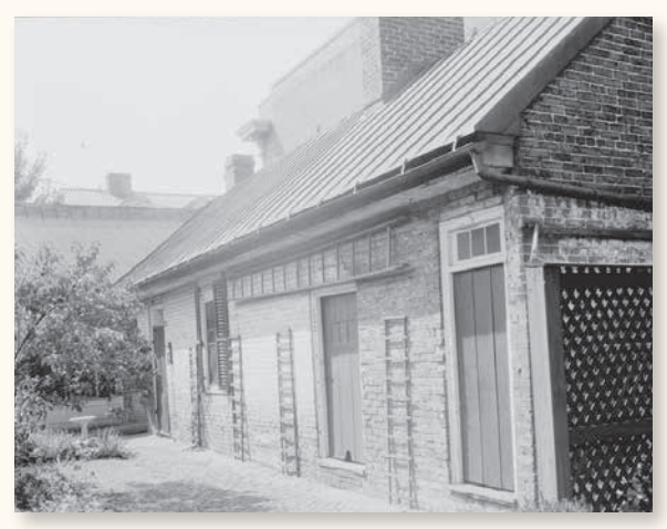
HABS photograph of the east elevation of the back building.